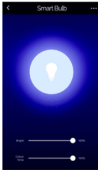
Cool White (6200K)

Installation can be easily done with three steps.