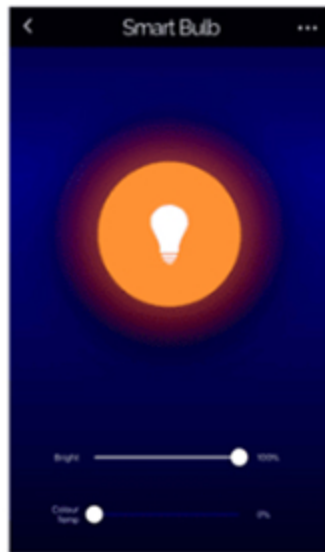
Warm White (2800K)